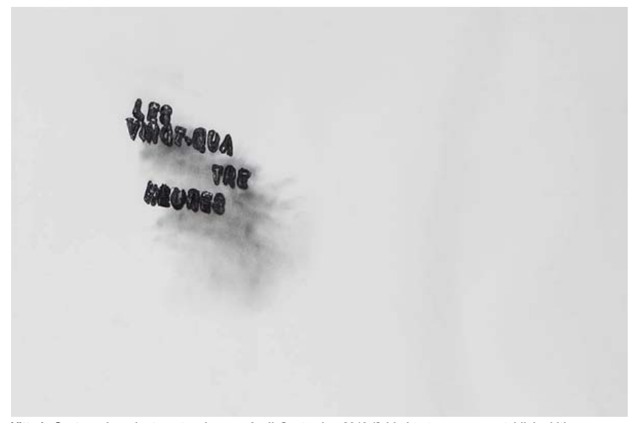
Vittorio Santoro, Les vingt-quatres heures, April-September 2010 (folded to trace a pre-established itinerary on a September afternoon) (detail), 2010, pencil on paper, 13 1/2 x 10."

Vittorio Santoro is an artist based in Paris and Dublin whose post-Conceptual mixed-media works probe questions of reception and interpretation. Here he discusses his latest solo exhibition, "Les vingt-quatre heures" (Twenty-four hours), which is on view at Campagne Première, Berlin, from September 2–October 15